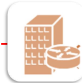
Remote site home branch