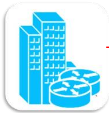
HQ Data Center

AutoCount Accounting internet user access option can help make remote work set up a lot easier as it is directly connecting to the company server database via internet connection.